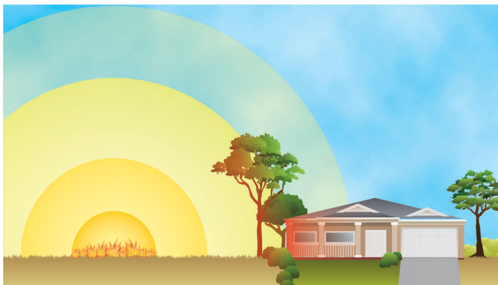
Figure 3: Radiant heat can kill living things and damage property