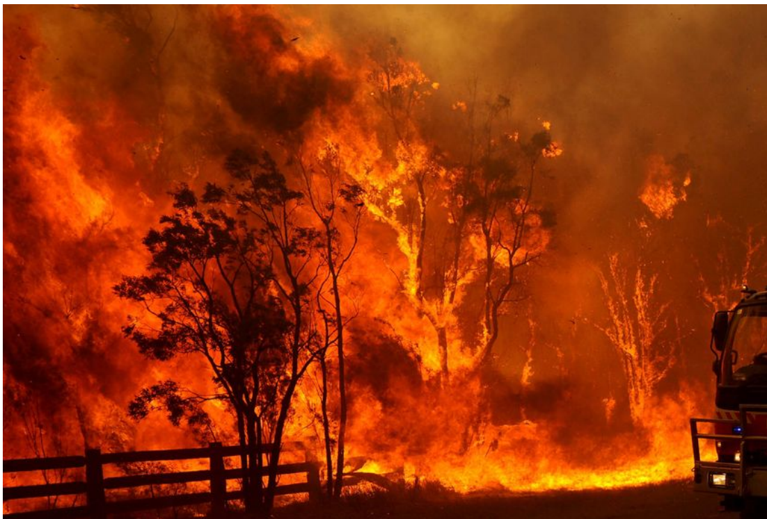
Figure 1: Fast moving fire front